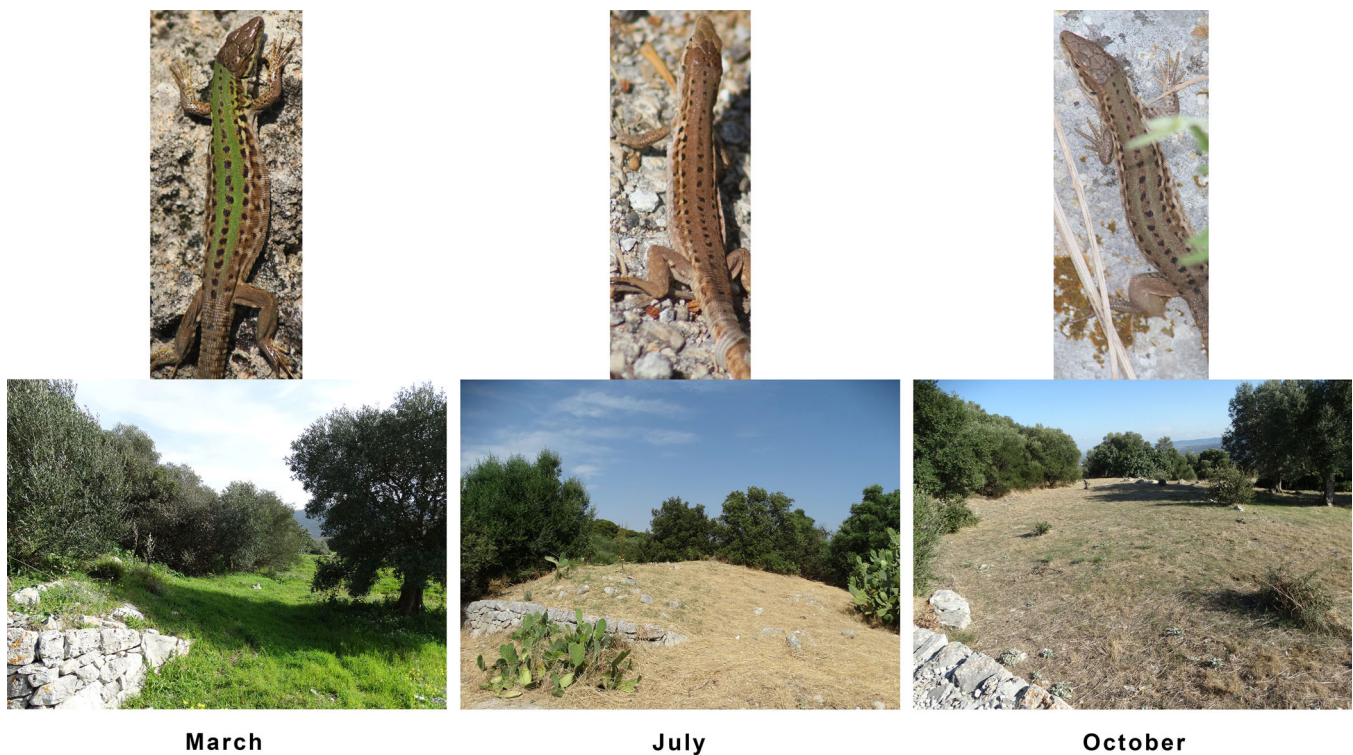
Fig. 3. Matching of colour variation of lizards and grassy habitats throughout the different seasons. The lizard in the picture is the same female individual photographically recaptured in all the three sampling sessions.

In conclusion, our study showed a seasonal variation in the dorsal pigmentation of a rather common lizard species. Furthermore, from the parallel analysis of the seasonal variation of the background, we have been able to demonstrate the high chromatic adaptation of lizards to the environment that changes over the seasons. In addition to being a fascinating phenomenon from an evolutionary perspective, to our knowledge it has been rarely observed in reptiles, particularly in lizards, and related solely to different habitat or elevations (Marshall et al., 2015; Moreno-Rueda et al., 2019), but not to season. Our results should be taken into account since many studies have described lizard taxonomic units based on chromatic patterns of a single season (Capolongo, 1984). Systematic studies should probably be reconsidered, in view of possible colour changes throughout different seasons.