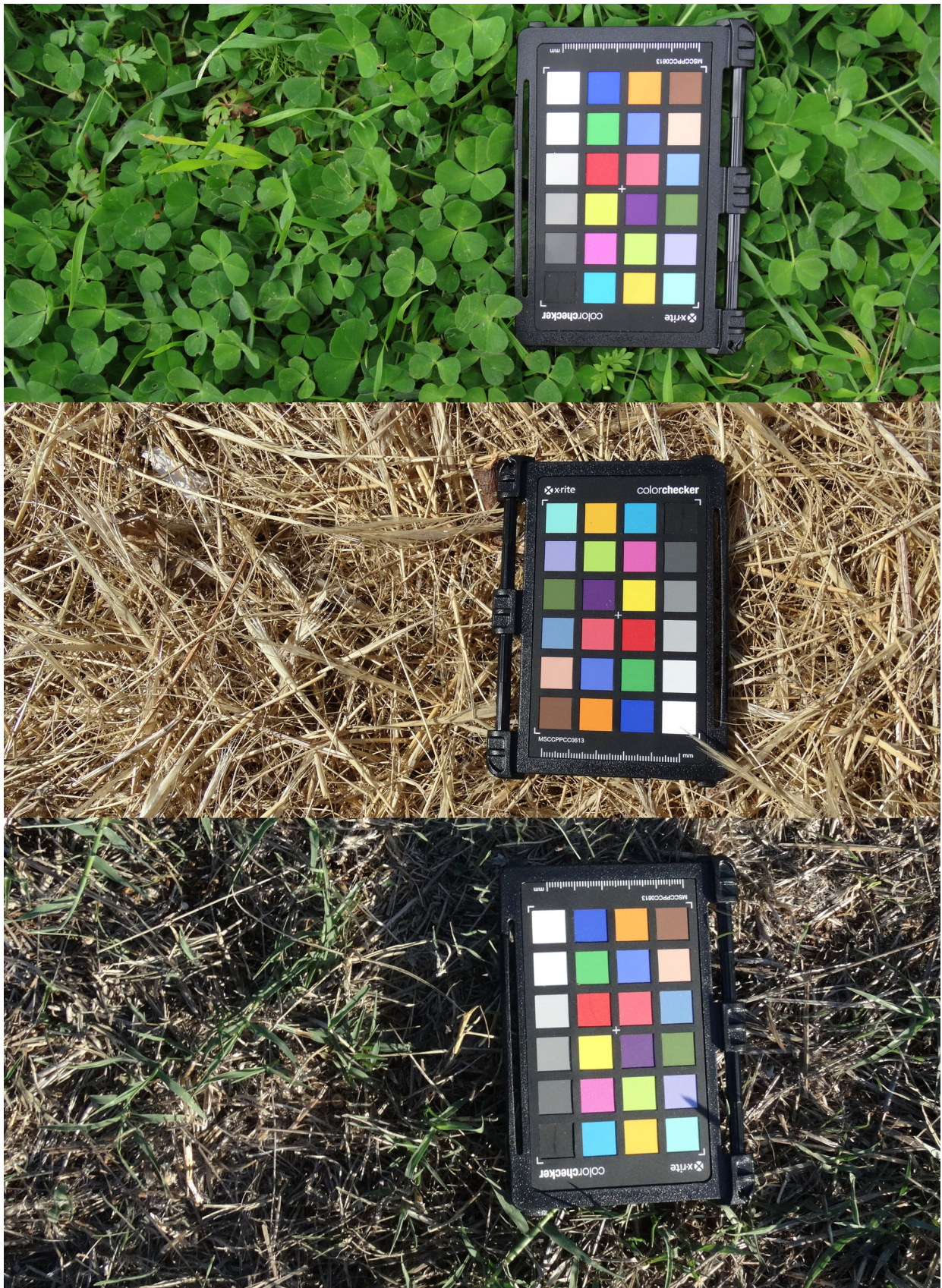
Fig. 5. Grassy vegetation photographed in March (top), July (middle) and October (bottom) 2019.