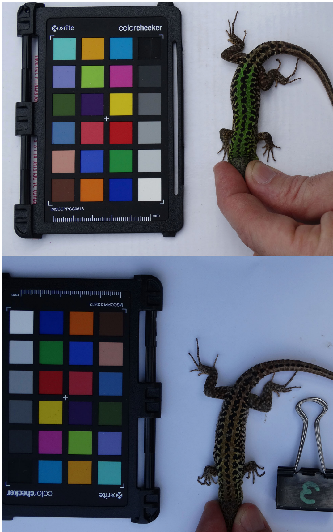
Fig. 4. Male captured in March (top) and recaptured in July 2019 (bottom), photographed adjacent to a GretagMacBeth Mini Color Checker chart.