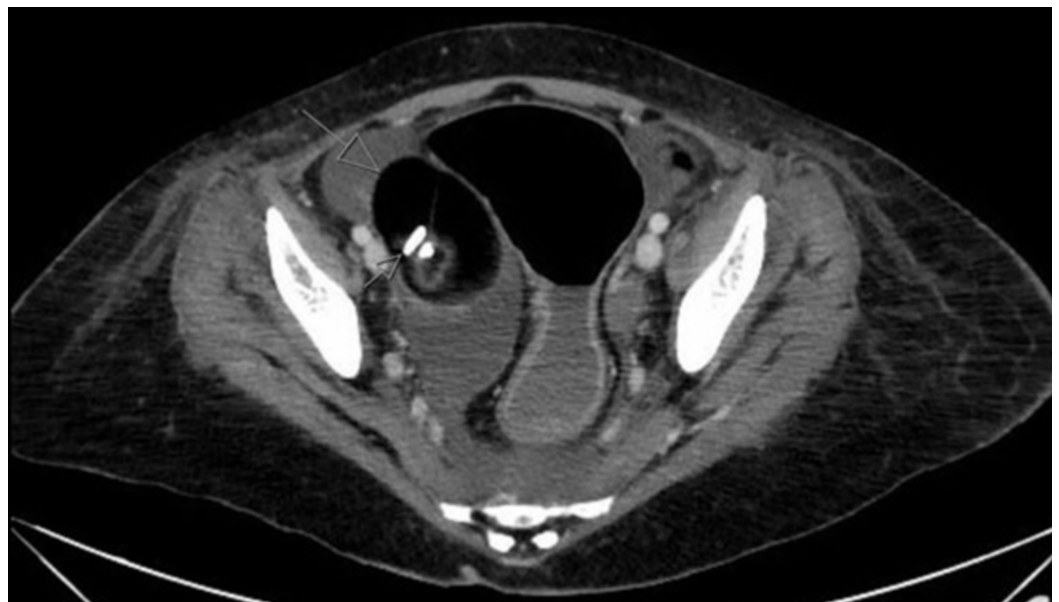
FIGURE 1: Preoperative CT scan of the abdomen/pelvis

Magnetic resonance imaging (MRI) of the brain showed no evidence of acute or intracranial abnormality. An electroencephalogram (EEG) was unremarkable. Cerebrospinal fluid (CSF) examination showed lymphocytic pleocytosis and oligoclonal bands. Electromyogram (EMG) and nerve conduction study (NCS) of the lower limbs showed mild non-specific myopathic changes. Computed tomography (CT) scan of the abdomen and pelvis showed a 7.2 x 6.3 x 5.5 cm mass of the right ovary that was highly suspicious for a mature teratoma with fat densities and calcified foci (Figure 1).