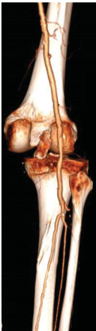
Fig. 4 CT angiography of the lower limb showed no lesion to the popliteal artery. CT, computed tomography.

rotating hinge knee replacement, instead an open reduction and multiligament reconstruction. Under spinal anesthesia and with a pneumatic tourniquet inflated on the right thigh, a standard midline incision with a medial parapatellar approach was utilized. A complete midsubstance tear of the ACL, posterior cruciate avulsion fracture with the bony fragment dislocated and rotated by 90 degrees in the intercondylar notch were found. The medial retinaculum and capsule were torn along with the distal end of the vastus medialis and the MCL was completely avulsed from the femoral footprint. Rotating hinge knee implant (NexGen RH Knee, Zimmer; Warsaw, Indiana, United States) with stemmed femoral and tibial component was used ( ► Fig. 6 ). After the definitive component implant, the MCL was reinserted to the femoral footprint using a 2.9-mm suture anchor (Juggerknot, Biomet; Warsaw, Indiana, United States); the medial retinaculum and the capsule were also repaired with absorbable suture.