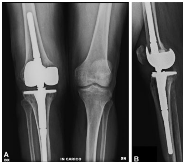
Fig. 7 (A, B) 12 months post-operative weight bearing X-rays.

rotation, 3,14 and it can be sustained from high- or low-energy trauma, especially in obese patients. 15,16