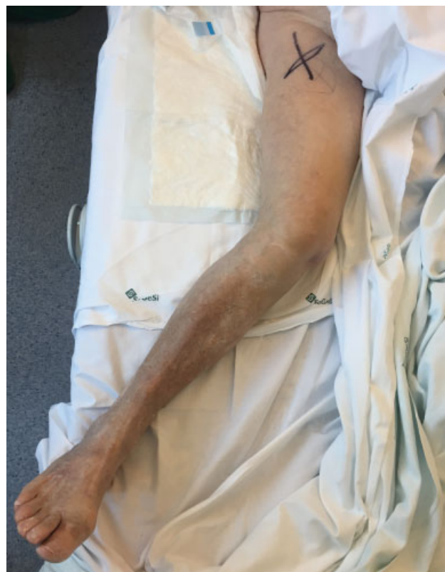
Fig. 5 Clinical picture of the angular valgus deviation of the right knee.

rotating hinge knee replacement, instead an open reduction and multiligament reconstruction. Under spinal anesthesia and with a pneumatic tourniquet inflated on the right thigh, a standard midline incision with a medial parapatellar approach was utilized. A complete midsubstance tear of the ACL, posterior cruciate avulsion fracture with the bony fragment dislocated and rotated by 90 degrees in the intercondylar notch were found. The medial retinaculum and capsule were torn along with the distal end of the vastus medialis and the MCL was completely avulsed from the femoral footprint. Rotating hinge knee implant (NexGen RH Knee, Zimmer; Warsaw, Indiana, United States) with stemmed femoral and tibial component was used ( ► Fig. 6 ). After the definitive component implant, the MCL was reinserted to the femoral footprint using a 2.9-mm suture anchor (Juggerknot, Biomet; Warsaw, Indiana, United States); the medial retinaculum and the capsule were also repaired with absorbable suture.