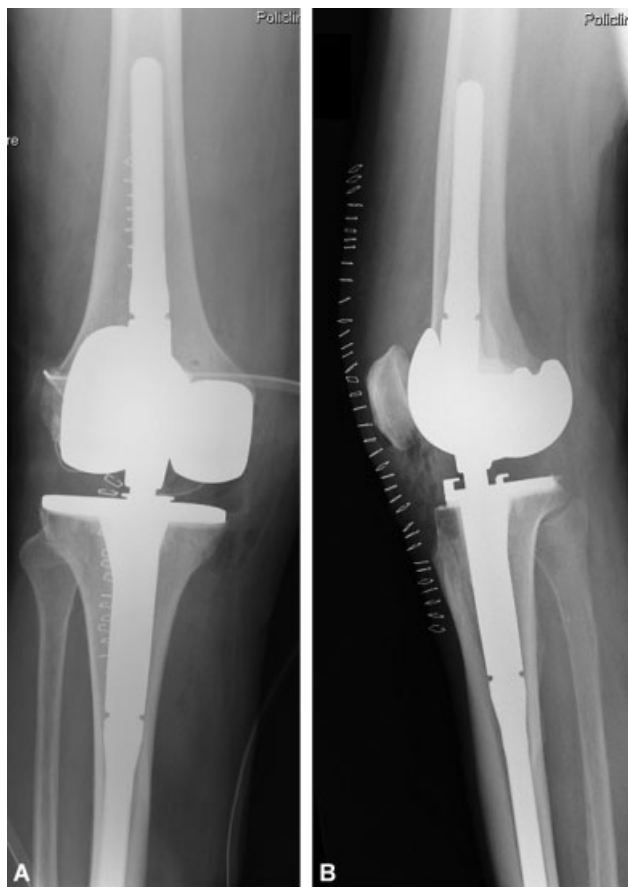
Fig. 6 (A,B) Postoperative X-rays with rotating hinge prosthesis implanted.