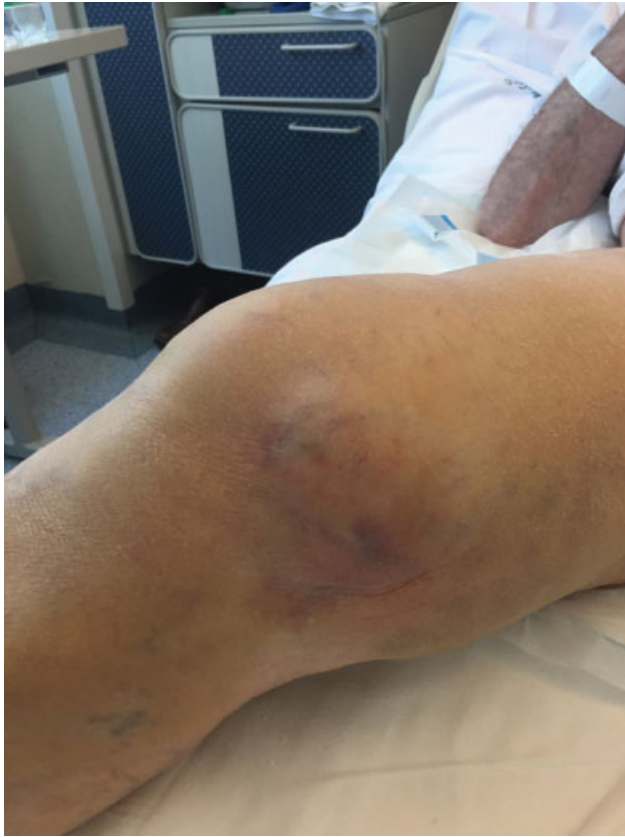
Fig. 1 Clinical picture of the medial side of the knee: the medial femoral condyle was just above the “pucker.”

revealed the right knee held in a slight flexion by 30 degrees and valgus deviation of 15 degrees. There was a diffuse tenderness around the knee with a transverse ecchymotic “puckering” of the skin over the anteromedial thigh; the medial femoral condyle was palpable just above the “pucker” (► Fig. 1 ). No peripheral sensory and motor nerve deficits were present and dorsal pedis and posterior tibial artery pulses were normal. It was impossible to evaluate the ligamentous stability of the knee.