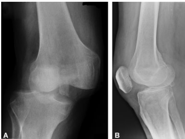
Fig. 2 (A, B) Plain anteroposterior and lateral radiographs of the right knee. AP, anteroposterior.

revealed the right knee held in a slight flexion by 30 degrees and valgus deviation of 15 degrees. There was a diffuse tenderness around the knee with a transverse ecchymotic “puckering” of the skin over the anteromedial thigh; the medial femoral condyle was palpable just above the “pucker” (► Fig. 1 ). No peripheral sensory and motor nerve deficits were present and dorsal pedis and posterior tibial artery pulses were normal. It was impossible to evaluate the ligamentous stability of the knee.