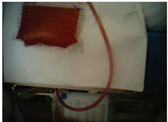
Red bag and tube.