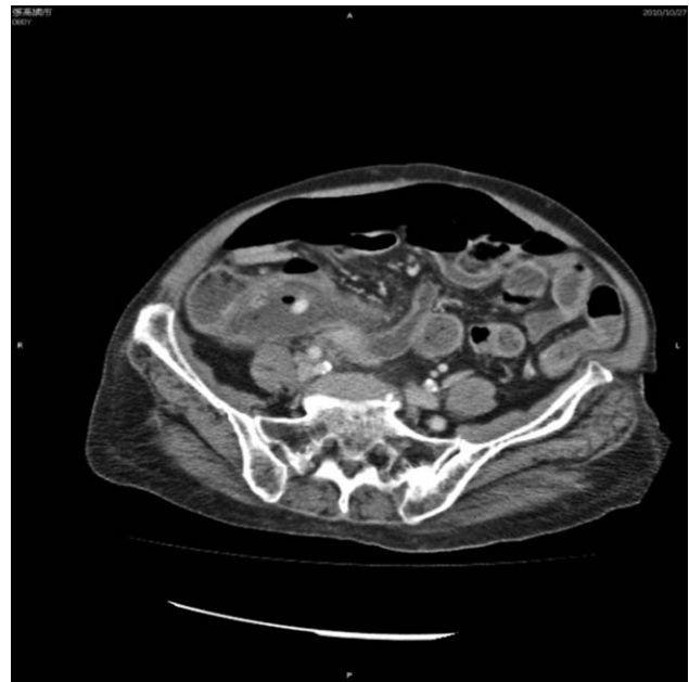
Fig. 1 CT image shows marked ileus, an abscess with a fecalith medial to the cecum, whereas the appendix cannot be identified. The retroperitoneal space under the abscess is uninvolved by the inflammation.

A 15-year-old boy came to our gastroenterology clinic with fever (39°C) and a 10-day history of right lower abdominal pain. Physical examination revealed local tenderness and guarding. Laboratory tests revealed marked leukocytosis (WBC count 26,780). Abdominal CT scan showed a 7.25 cm × 7 cm × 5 cm abscess containing a free radio-opaque fecalith medial to the cecum, whereas the appendix could not be identified (Figs. 3, 4). Under general anesthesia, the same operative procedure was performed. More than 100 mL of pus was evacuated, and the fecalith was removed. An 18-French Foley sump was left in the abscess cavity. Follow-up CT showed complete resolution of the abscess (Fig. 4). After antibiotic treatment with Flomoxef and metronidazole for 10 days, and removal of the drainage tube on the eighth postoperative day, the patient was discharged without any complications.