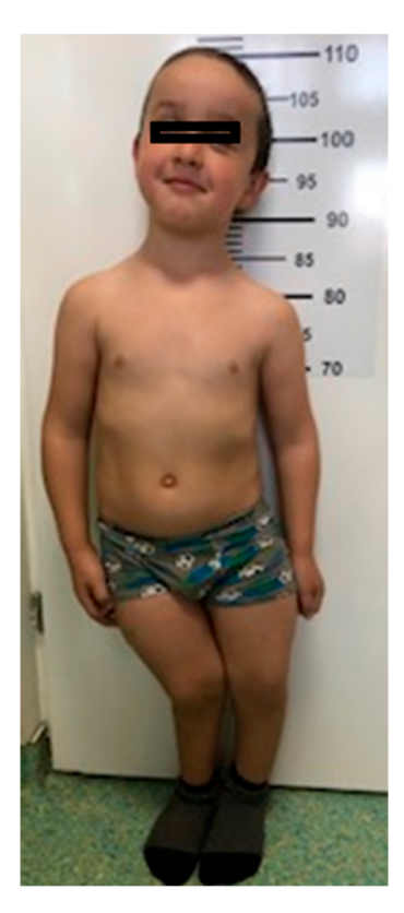
Figure 2. Case #2. Brother at 7 years old: short stature, macrocephaly, genu valgum deformation of lower limbs, knees touching each other while ankles remain spaced apart.