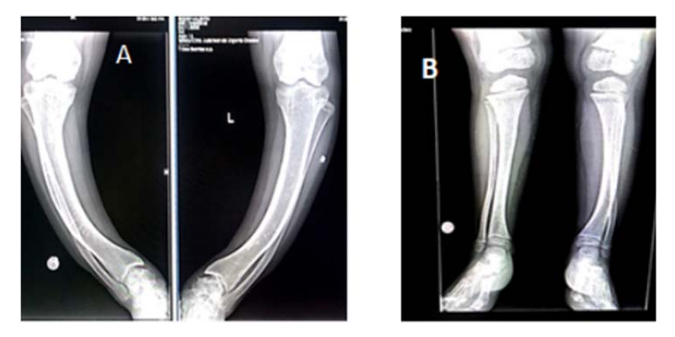
Figure 4. Tibial and fibular radiography (April 2022). ( A ): Case #1: tibial scoliostosis, mild bilateral fibular deformation, closed growth plates. ( B ): Case #2: left tibia: scoliostosis in varum, right tibia: scoliostosis invalgum.

3.4. Psychological Aspects: Case#1 Displays Low Self-Esteem Due to Motor Difficulties (Increased Emotional Sensitivity, Shyness in Unfamiliar Environments). Frequent Episodes of Sadness. Case#2 Periods of Anxiety and Anger