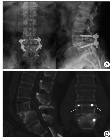
Fig. 3. Plain radiographs (A) and CT sagittal and coronal reconstruction images (B) at postoperative 7 weeks. A : Anterior dislodgement of the fusion cage as well as reduction loss of the spondylolisthesis at the L4-5 level. B : CT images showing that the intervertebral space was not fused and the L4 pedicle screws were loose with osteolysis (white arrows).