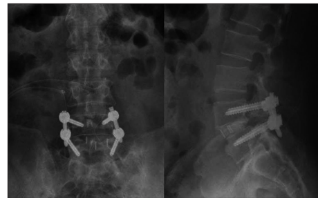
Fig. 2. Immediate postoperative radiographs showing a good reduction of the spondylolisthesis and a well-positioned fusion cage.

ened with halo change (Fig. 3B). Physical signs and laboratory findings on admission did not support infection. Revision surgery using an anterior approach was performed to remove the displaced cage. A 5-cm-long midline incision was made and a retroperitoneal approach to the affected level was done using a robotic arm retractor. The anterior longitudinal ligament and annulus were not perforated. The cage had slipped down and was positioned anterior to the L5. After removal of the cage and previously grafted bones in the disc space, the endplates were carefully prepared. A wedge-shaped, lordotic titanium cage (WSH cage, WINNOVA CO., Ltd., Seoul, Korea) filled with allograft chips was inserted a little laterally to the left to avoid a collapsed portion of the inferior endplate of the L4 body. After the closure of the anterior surgical wound, the patient was positioned prone for pedicle screw replacement. The pedicle screws found unstable and in spite of being with thicker and longer ones, two L4 screws still remained loose. Therefore, cement augmentation was added to the L4 screws (Fig. 4A). Postoperatively, however, the patient complained of persistent pain on the