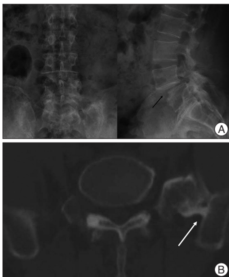
Fig. 1. Preoperative plain radiographs (A) and CT (B) showing a L4-5 grade I isthmus spondylolisthesis, dysplastic L5 body (back arrow) and lumbosacral transitional vertebra which consists of a bony union between an L5 transverse process and the sacrum on the left side (white arrow).