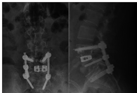
Fig. 5. Plain radiographs after the second revision surgery showing the removal of the left L5 screw and bilateral extension of the pedicle screw fixation to S1.

anterolateral side of the left leg and difficulty in walking. CT images showed a fracture on the pedicle and anterolateral lateral body wall of the L5 vertebra (Fig. 4B). As a result, he had additional surgery for paraspinal decompression on the left side at the L4-5 level. Removal of the left L5 screw followed by bilateral extensions of the pedicle screw fixation to S1 was performed (Fig. 5). Because the L5-S1 level was congenitally fused due to the LSTV, we considered that extension of the screw fixation made no additional motion limitation of the lumbosacral spine but increased stability.