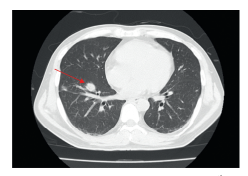
FIGURE 1: The chest computed tomography on the 1<sup>st</sup> day showing multiple nodules (red arrow).

Leptospirosis is a zoonosis caused by the pathogenic spirochete Leptospira spp. Its occurrence is distributed throughout the world but is especially frequent in tropical areas [8]. The main vectors are rodents. Leptospira infects humans via contact of the skin, mucous membranes, and conjunctiva with animal urine and contaminated water and soil. After the incubation period, which is usually ten days, fever, muscle pain, and headache appear in 75–100% of patients [9]. When leptospirosis becomes severe, it complicates with symptoms of jaundice and renal failure [1]. That is also known as Weil's disease. Conjunctival hyperemia has also been observed in 55% of cases and is a symptom useful for differentiation from other infectious diseases [2].