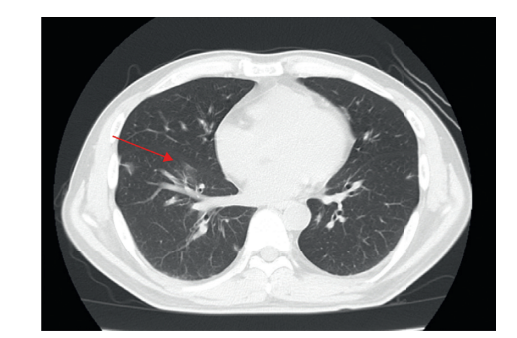
FIGURE 2: The chest computed tomography on the 38th day showing multiple nodules disappeared (red arrow).