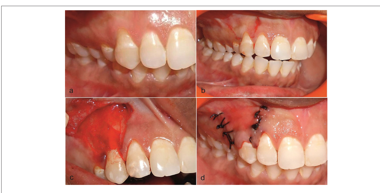
FIGURE 2 | (a) Preoperative view of the recession on the upper right first premolar at the test side. (b) Incision was placed. (c) Trapezoidal mucoperiosteal flap was raised up to the mucogingival junction and AM placed on the recipient site. (d) Coronally positioned flap was sutured.