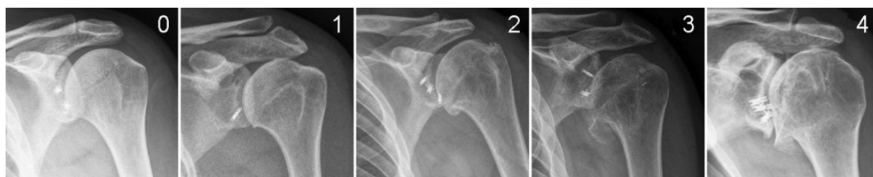
Figure 1. Radiographs showing the different Buscayret grades for glenohumeral arthropathy. Grade 0, no arthropathy; grade 1, presence of humeral osteophyte with a maximum diameter of <3 mm; grade 2, humeral osteophyte between 3 and 7 mm; grade 3, humeral osteophyte ≥8 mm; grade 4, complete obliteration of the glenohumeral joint space.