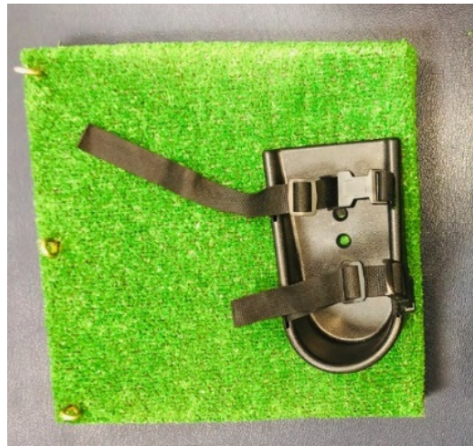
Figure 2. Shoe supporter.

Loaded functional strength training was carried out with resisted forward step-ups, lateral step-ups, squats, sit-to-stand, and stoop-and-recover exercises (Figure 3). The exercises were carried out in a circuit fashion. A customized weight vest was used to give resistance. The weight vest had a weight pocket bearing different loads, ranging from 0.25 to 6 kg. The weight vest's load was evenly distributed anteriorly, posteriorly, and to the sides [6]. The weights were added into the pockets of the body vests based on the individual eight-repetition maximum (8 RM) test [18], according to gross motor function classification system levels I and II. We estimated 8 RM to be around 35% and 30% of the child's total weight [4]. The load was gradually raised to match the child's strength until all tasks were practiced with a maximum of 75% of 8 RM (Table 1). Each session was initiated with a 10 min warm-up period, including stretching of the major muscles and muscle groups, and terminated with a 10 min cool-down period in the form of aerobic exercises. Both groups received their training program for 60 min with a rest interval of 2 min between different types of exercises, with a frequency of 3 days/weeks for a duration of 12 weeks.