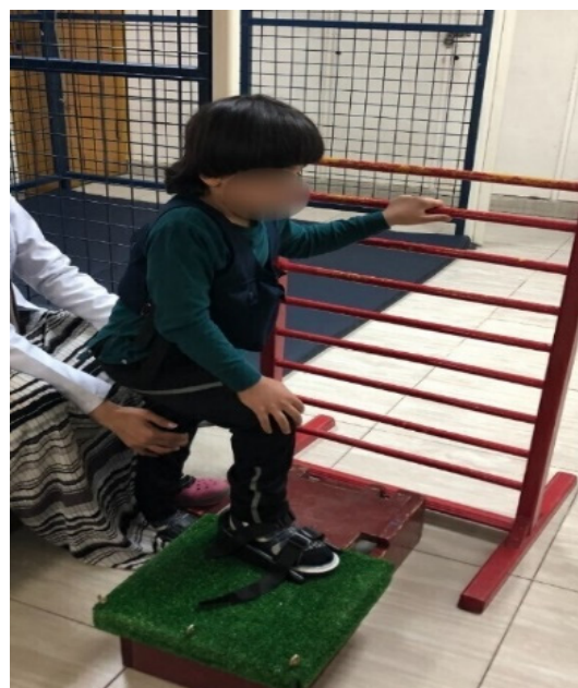
Figure 3. Forward step-up exercise.

Loaded functional strength training was carried out with resisted forward step-ups, lateral step-ups, squats, sit-to-stand, and stoop-and-recover exercises (Figure 3). The exercises were carried out in a circuit fashion. A customized weight vest was used to give resistance. The weight vest had a weight pocket bearing different loads, ranging from 0.25 to 6 kg. The weight vest's load was evenly distributed anteriorly, posteriorly, and to the sides [6]. The weights were added into the pockets of the body vests based on the individual eight-repetition maximum (8 RM) test [18], according to gross motor function classification system levels I and II. We estimated 8 RM to be around 35% and 30% of the child's total weight [4]. The load was gradually raised to match the child's strength until all tasks were practiced with a maximum of 75% of 8 RM (Table 1). Each session was initiated with a 10 min warm-up period, including stretching of the major muscles and muscle groups, and terminated with a 10 min cool-down period in the form of aerobic exercises. Both groups received their training program for 60 min with a rest interval of 2 min between different types of exercises, with a frequency of 3 days/weeks for a duration of 12 weeks.