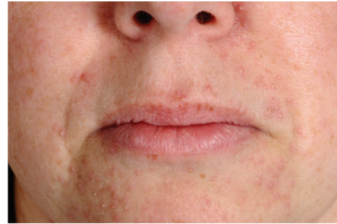
Figure 2 An example of the papulopustular (acneiform) rash experienced by some participants in response to treatment with oral gefitinib. The rash is most prominent in areas exposed to UV light, i.e. the face, neck and décolletage.

All participants promptly resumed their menstrual cycles (i.e. within 6 weeks of cure), and 3/8 so far have achieved a subsequent spontaneous