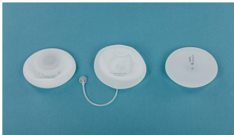
Figure 2 Breast implants (from left to right): temporary expander ( type I ), expandable implant ( type II ), permanent implant ( type III ).

Three types of implants were used during the study period (Figure 2 and Figure 3): type I , temporary expanders with a single lumen and an integrated magnetic port at the center of the implant for postoperative expansion; type II , expandable implants that are designed for a definitive one-stage breast reconstruction. They contain an outer chamber with silicon gel and a smaller inner chamber that may be inflated postoperatively with saline via the remote injection port placed subcutaneously on the chest wall; type III , permanent implants filled with silicon gel with a predefined volume.