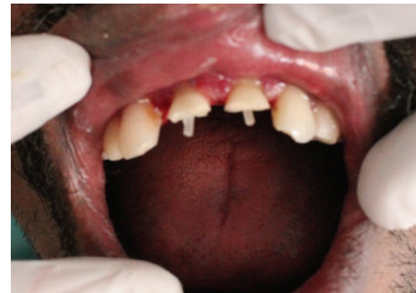
FIGURE 3: After fiber post fixation.

with satisfactory aesthetics. Periodontal status was good with 1mm pocket. Gingival tissues had a normal texture with a normal contouring (Figure 5). Intraoral periapical radiograph showed intact tooth structure with intact lamina dura (Figure 6).