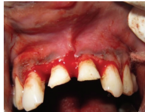
FIGURE 2: Gingivectomy of 11 and 21.