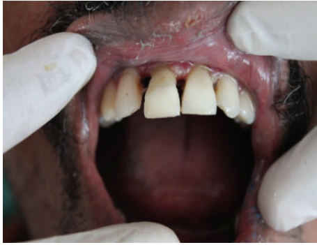
FIGURE 4: Immediate postoperative view.