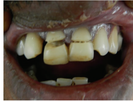
FIGURE 1: Preoperative view.

Patient was recalled after six months and one year. On examination, 11 and 21 were found to be asymptomatic