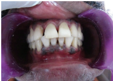
FIGURE 5: Postoperative view after one year.