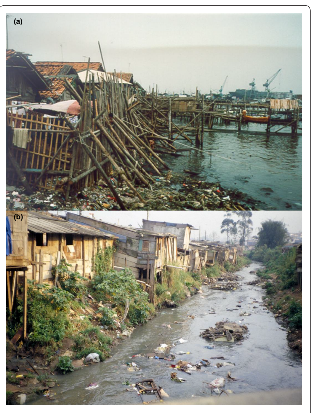
Figure 1. Cholera-endemic living conditions. (a) Conditions of ramshackle housing, poor sanitation and widespread fecal contamination prevalent in North Jakarta in the early 1990s when phase 2 pediatric clinical trials with CVD 103-HgR live oral cholera vaccine were carried out. (b) Similar conditions of inadequate housing, lack of sanitation and fecally contaminated surface waters in a favella (periurban slum) in São Paulo, Brazil of the type in which environmental enteropathy was first described by Fagundes Neto.

small intestine. It is also possible that some individuals may have baseline intestinal immunity not reflected by an elevated serum vibriocidal titer.