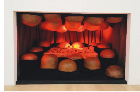
FIGURE 1: Louise Bourgeois, the Destruction of the Father, 1974.