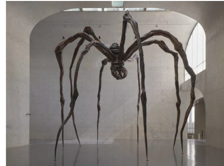
FIGURE 2: Louise Bourgeois, Maman Spider, 1999, Long Museum West Bund, Shanghai, 2018.