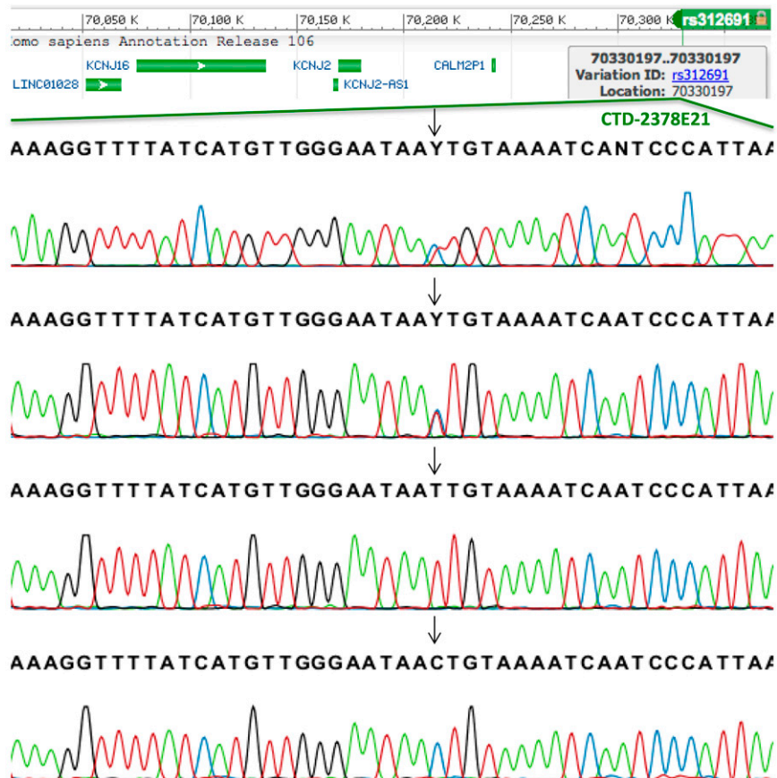
Figure 1. Position and chromatogram representation of the risk allele C of rs312691 within lincRNA CTD-2378E21.1 found in association with TPP. The C risk is located ~150 kb downstream from the KCNJ2 gene (Kir2.1 channel), which might affect the transcription of the gene and result in periodic paralysis during thyrotoxicosis. The top two chromatograms demonstrate the heterozygous TC genotype and the bottom ones, the homozygous TT and CC genotype.

To the best of our knowledge, our study has demonstrated for the first time in non-Asian TPP patients that the frequency of the TPP risk allele, which was previously identified in three independent Asian populational studies [5–7], is significantly greater in Brazilian TPP patients than in TWP patients or 1000 population genetic controls. Variants located far downstream of KCNJ2 in the desert gene 17q24.3 locus are found in linkage disequilibrium, albeit with slightly different likelihood ratios [5–7]. Besides, no deleterious mutation was observed in ion-channel genes within 17q24.3 region using WES, reinforcing a more convincing association between the risk C allele and susceptibility to TPP.