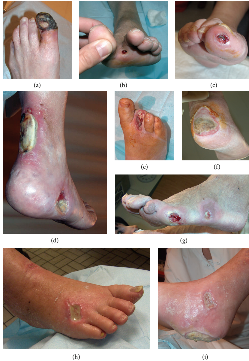
FIGURE 3: Examples of wounds with ambiguous angiosome categorization. (a), (b), (c), (e) Circumferential necrosis, wounds located at the tip or interdigital web space, and nonhealing amputation sites do not allow differentiation between angiosomes derived from the anterior and posterior tibial artery. (d) Territories such as the achilles tendon are not unequivocally associated with a particular angiosome. (f), (g) Wounds that extend into an adjacent angiosome, or lie on the verge of two angiosomes. (h), (i) Two pictures of the same foot showing multiple wounds (dorsal, medial malleolar, and heel) residing in different angiosomes.

standard angiosome-sketches suggest. Only a peroperative angiographic assessment with attention to anatomical variants and collateral flow (as opposed to a pure anatomical topographic classification) reliably confirms which artery should be considered as the feeding artery of a wound bed.