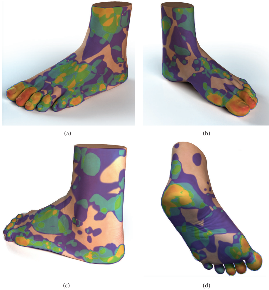
FIGURE 1: Composite image of all wounds showing predisposing areas. Likelihood to contain wounds varies from red (most likely) to blue (least likely).

hospital. This registry contains general demographic data as well as digital photographs of the wounds that patients initially present with. These high-resolution pictures are taken from multiple angles so that all sides of the foot are recorded. From this database, we retrieved all patients that had been scheduled for BTK revascularization. The indication for revascularization was established when the angiography showed at least one high-grade stenosis (>50% lumen diameter reduction) or occlusion distal from the popliteal artery. The localisation and shape of each wound was discerned from photographs, and we tried to determine to which angiosome a wound belonged. The anatomical demarcation of foot angiosomes was obtained from benchmark diagrams previously sketched up by Taylor et al. [8] and Attinger et al. [9]. If we were unable to unambiguously assign a wound to its angiosome, we recorded the reason why. Two investigators independently scrutinized the pictures and if discrepancies were found, the mismatched cases were reassessed and resolved by consensus.