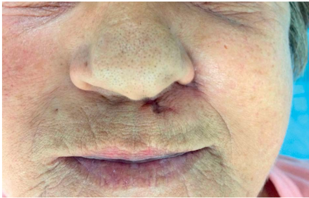
Fig. 2. Inside nasal vestibule mould applicator