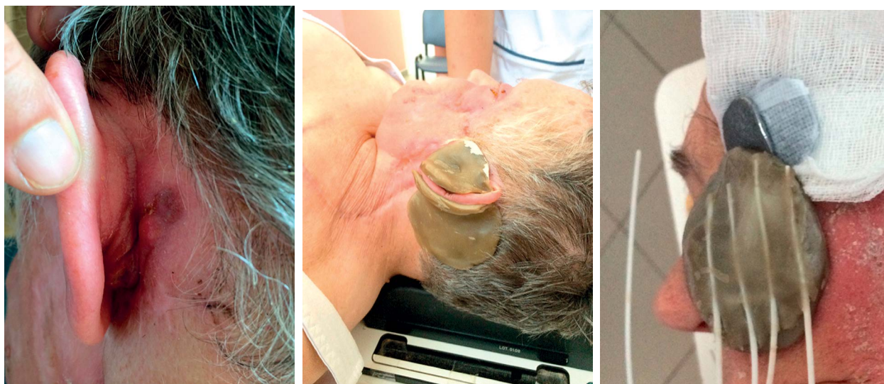
Fig. 1. Earlobe and nose mould applicator

Computed tomography contrasting wire with metal core was attached to skin in order to mark treatment area during CT scanning. Target volume consisted of tumor or tumor bed in post-surgery condition with 5 mm margin. Markers for reconstruction of source dwell position were