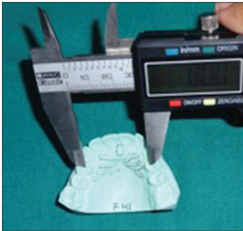
Figure 2: Measurement of maxillary first inter-premolar width

Palatal depth has a high positive value of sexual dimorphism (10.62) between males and females. Thus it can contribute to sexual dimorphism [Table 5].