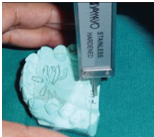
Figure 4: Measurement of palatal depth