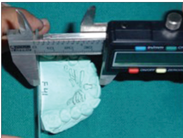
Figure 3: Measurement of anteroposterior palatal width