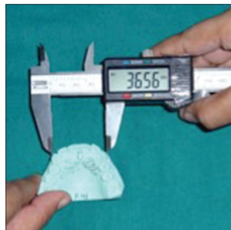
Figure 1: Measurement of maxillary inter-canine width

The mean maxillary inter-canine width was higher in males than females, even though the standard deviation was lower in females as compared to males. The maxillary inter-canine width of males and females showed a significant difference in the means of the two populations [Table 1].