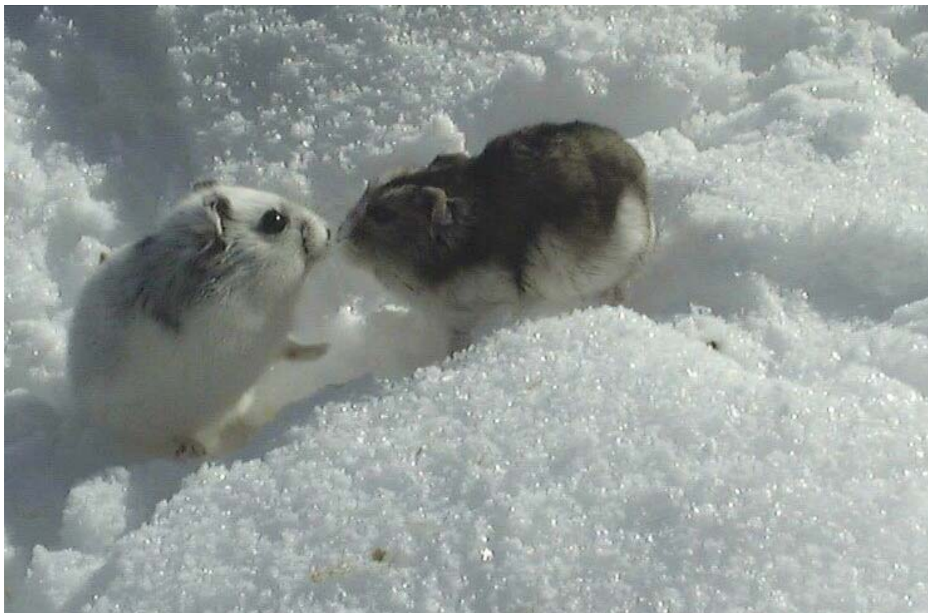
Figure 1 Djungarian hamsters displaying the typical winter and summer pelage.

predominance in NREM sleep in the low frequency range both in the hamsters in winter physiology (1.25–2.5 Hz) and summer physiology (1.25–4.0 Hz). The difference between the derivations remained the same in the winter and summer physiology hamsters.