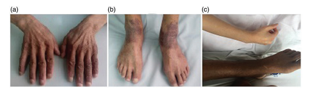
Figure 1. Pigment deposition. (a, b) Pigment deposition in the dorsum of hands and ankles in case 1. (c) Pigment deposition in the lower limbs in case 2 (upper, healthy female; lower, patient limbs)

The patient showed hypothyroidism, with thyroid-stimulating hormone, free triiodothyronine, and free thyroxine levels of 8.52 (normal range: 0.35–4.94 mIU/L), 1.55 (normal range: 2.63–5.70 pg/mL), and 0.63 (normal range: 0.7-1.48 ng/dL), respectively. His testosterone level was 0.42 (normal range: 1.75–7.81 µg/L) and pituitary prolactin level was 15.58 (normal range: 2.64-13.13 µg/L). The patient was therefore considered to have hypogonadism. His cortisone levels at midnight, 8 am, and 4 pm were 5.55 (normal range: 0.00–5.00 μg/dL), 7.92 (normal range: 6.70–22.60 µg/dL), and 7.06 (normal range: 0.00-10.00 \mu g/dL ), respectively, and his adrenocorticotropic hormone (ACTH) levels at 8 am and 4 pm were 55 (normal range: 1-80 ng/L) and 34 (normal range: 5–40 ng/L), respectively. He was therefore diagnosed with mild adrenal