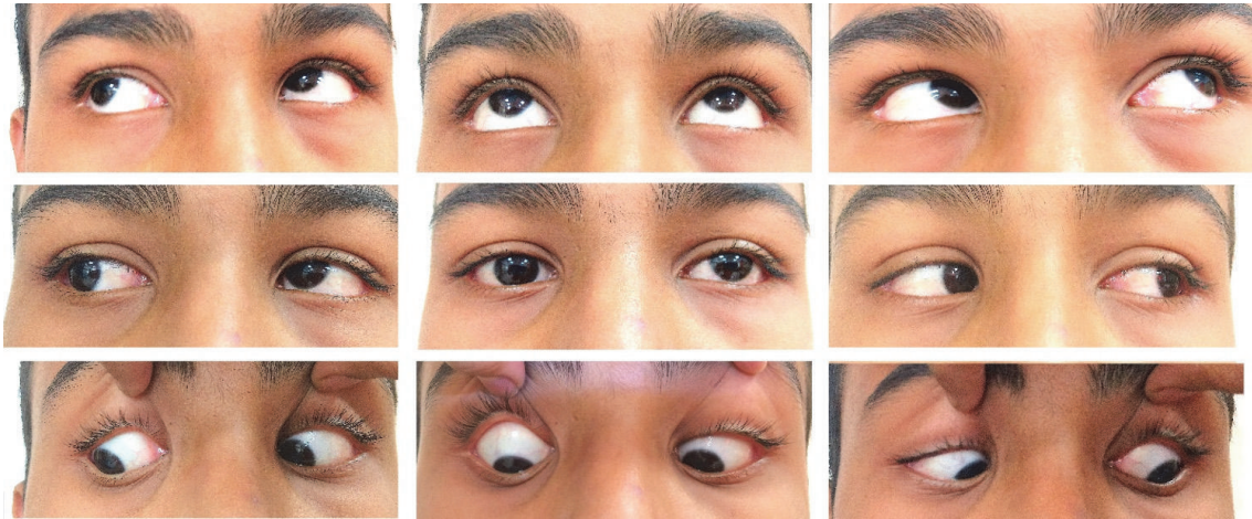
FIGURE 1: Clinical photograph of 9 cardinal gazes at presentation.

Revisiting old photographs did not reveal any plagiocephaly or facial asymmetry, thus negating a congenital deviation. Hematological investigations also did not reveal any anaemia, thyroid dysfunction, or any other abnormality.