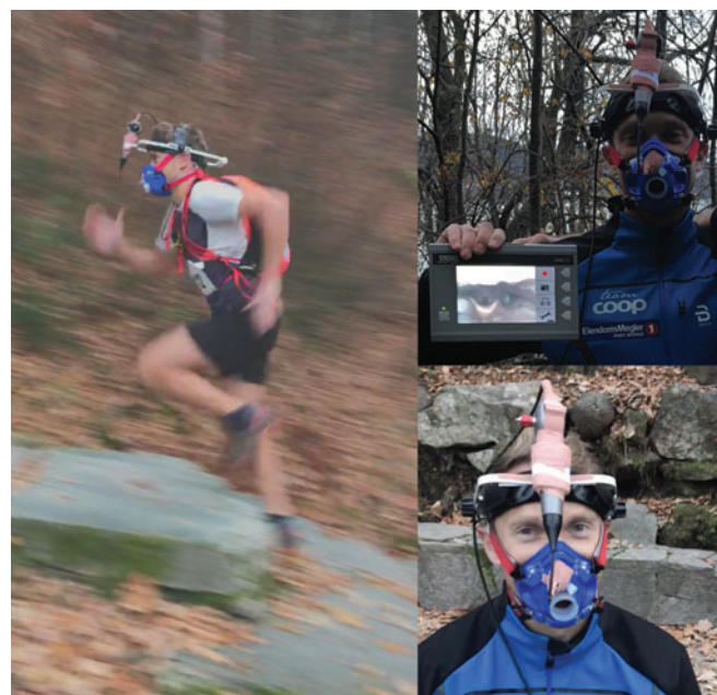
Figure 1 The participant at rest and running with the portable video-laryngoscope attached. The monitor shows the video-recording of the laryngeal area (upper right image).

Normally distributed data were presented as means with SD and skewed data as median with ranges. Intraindividual changes in spirometry values were calculated using