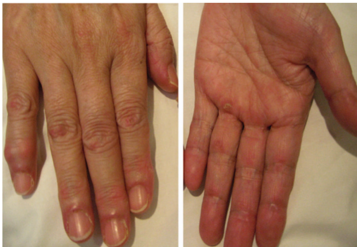
Figure 1. Erythemas on the nail circumference and both dorsal and palm sides around the PIP and MCP joints. MCP = metacarpophalangeal (MCP), PIP = proximal interphalangeal.

Laboratory investigations showed the following results: partial pressure of arterial oxygen (PaO 2 ) 73.5 mm Hg, white blood cell count (WBC) 9400/ \mu L (neutrophils 89.5%, lymphocytes 9.3%), hemoglobin (Hb) 12.1 g/dL, platelet (PLT) 27.0 \times 10^4 / \mu L, C-reactive protein (CRP) 3.4 mg/dL, lactate dehydrogenase (LDH) 231 IU/mL (normal range 124–222), ferritin 319 ng/mL (normal range 6.0–138). The levels of creatinine kinase and aldolase were 79 IU/L and 3.6 IU/L, respectively (= within the normal range). Although the serum Krebs von den lungen (KL)-6 level was 274