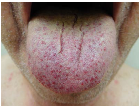
Figure 2 Telangiectases on the tongue of an 85-year-old man with hereditary hemorrhagic telangiectasia who suffered from occasional episodes of epistaxis.

favor sun-exposed areas. 1 Telangiectases blanch with pressure and color returns when pressure is released; this distinguishes them from petechiae and angiomas. 2 Lesions may bleed at times with little trauma, due to their proximity to the skin surface and also on account of their tortuous vessels. 2 Notably, telangiectases often increase in number as the patients age. 1