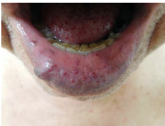
Figure 3 Vascular lesions on the lips of an 85-year-old man with hereditary hemorrhagic telangiectasia.

Pulmonary AVMs develop in 15%–50% of patients. The patients are usually asymptomatic. Lung AVMs cause right-to-left shunting, which cause an array of possible symptoms