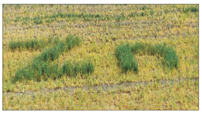
Figure 2: Effect of foliar applied zinc on growth of barley plants in Central \mbox{Anatolia}^{\rm [106]}

Recent studies also indicate that intercropping systems contribute to grain zinc and iron concentrations. Various field tests in China with peanut/maize and chickpea/ wheat intercropping systems showed that gramineaceous species are highly beneficial in biofortfying dicots with micronutrients. In the case of chickpea/wheat intercropping, zinc concentration of the wheat grains was 2.8-fold higher than those of wheat under mono-cropping.<sup>[108]</sup> In many wheat-cultivated countries, continuous wheat cropping is a widely used cropping system. Inclusion of legumes in the crop rotation system may contribute to grain concentrations