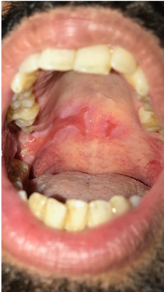
Fig. 1 Confluent erosions on the hard and soft palates