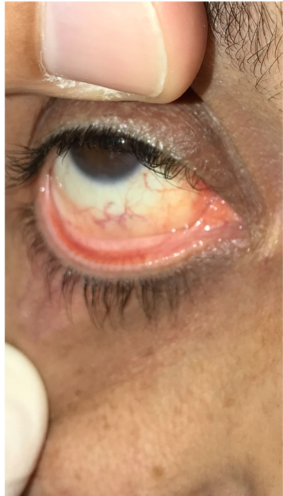
Fig. 2 The right eye showing shortening of the fornix

matrix, which can constitute a safeguard against autoimmunity [3].