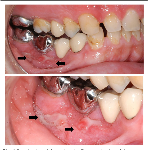
Fig. 1 Examination of the oral cavity. The examination of the oral cavity detected ulcerative lesions of the buccal-side mucosa of the right mandible

To rule out malignancy, a biopsy of the oral lesions was obtained and revealed ulcerative stomatitis with noncaseating granulomas consistent with oral CD (Fig. 2). Intensification of immunosuppressive therapy was initiated by shortening the adalimumab administration interval to weekly administration. A follow-up examination after