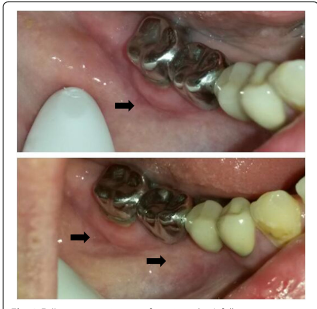
Fig. 3 Follow-up examination after 10 weeks. A follow-up examination after 10 weeks confirmed a complete healing of the oral CD lesions

Concluding, oral lesions are a rare manifestation of CD and gastroenterologists should consider these lesions as a possible marker of disease activity in patients despite having quiescent intestinal CD.