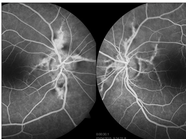
Figure 3: Fluorescein angiography showing linear hyperfluorescent streaks radiating from the optic disc in both eyes