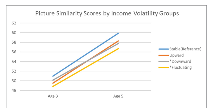
FIGURE 3 | Trajectory of picture similarity scores from age 3 to 5 across income volatility groups. Note: *Statistically significant change between volatility group and stable income group in the regression analysis.

low-income households, albeit only for receptive vocabulary. Average family income was not significantly associated with changes in children's problem-solving abilities.