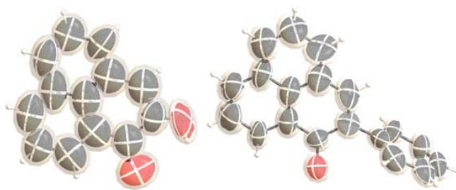
Figure 2. ORTEP diagram (50% probability) of isolated natural product ( left ) and synthetic product ( right ).