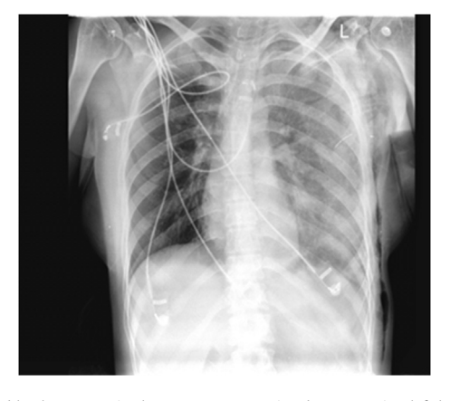
Fig. 1. Portable chest x-ray in the Emergency Service demonstrating left hemothorax.

additional traumatic injuries were noted. A right subclavian venous catheter was inserted and fluid and erythrocyte transfusion applied. While receiving bolus fluid challenge and mechanical ventilation support she was urgently transferred into the operating room. Intraoperative exploration demonstrated no major vascular or heart laceration. Parenchymal stab wounds at left upper lobe anterior and lower lobe posterior segments and the stab wound at the right hemithorax were primarily sutured. Additionally a right tube thoracosthomy was applied prophylactically. Upon intraoperative consultation Neurosurgery consultants recommended primary saturation of the paraspinal and stab wounds. The patient was transferred to the intensive care unit (ICU) and put on mechanical ventilation support after the operation. On admission to ICU the vital signs were: blood pressure 112/58 mmHg (without inotropic or vasopressor support), heart rate 100 beats/min, respiratory rate 16/min (on volume cycled controlled mechanical ventilation), temperature 37.3 C and oxygen saturation 95%. Control chest x-ray in the intensive care unit showed no complication.