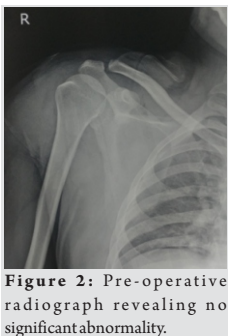
Figure 2: Pre-operative radiograph revealing no significant abnormality.

The biceps variant observed in our case was originating from the inferior surface of supraspinatus in close proximity to the posterior capsule later coursing along the deltoid. However, the unusual biceps origin did not seem to be the reason for symptomatology of the subject. This finding of ours is consistent with other published reports of asymptomatic aberrant origins of the long head of the biceps [8, 9]. Many authors described LHBT originating from the rotator cuff; however, their precise role in development of various shoulder pathologies is often debated on. Hyman and Warren [10] described an extra-articular origin of the long head of the biceps from the supraspinatus. MacDonald [11] reported a case of long head taking origin from the superior labrum but was also found adherent to the undersurface of the cuff intra-articularly. Kim et al. [12] reported a case of LHBT taking origin from the intra-articular rotator cuff. Lang et al. [13] described a variant in which LHBT originated from the rotator cable and lacked an attachment at the superior labrum, which was also associated with a partial articular-sided rotator cuff tear. Most of the authors quoted above noticed anomalous origin of biceps tendon found incidentally on arthroscopy itself was not pathologic and was left intact. They reported complete resolution of symptoms after the management of concomitant