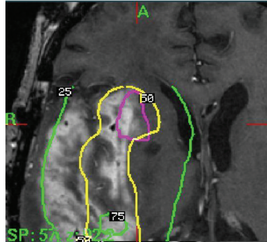
FIGURE 1: Gamma Knife treatment planning illustration of dose on an axial T1 postgadolinium MRI scan for the first Gamma Knife treatment.

Following the consultation with a neurosurgeon and discussing the possibility of a brain tumor and treatment options, the patient underwent a right temporal lobe lobectomy. The final pathology was consistent with GBM.