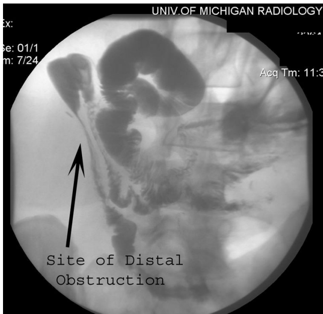
Figure 1 Fistula injection with small bowel follow-through demonstrating distal obstruction of small bowel.