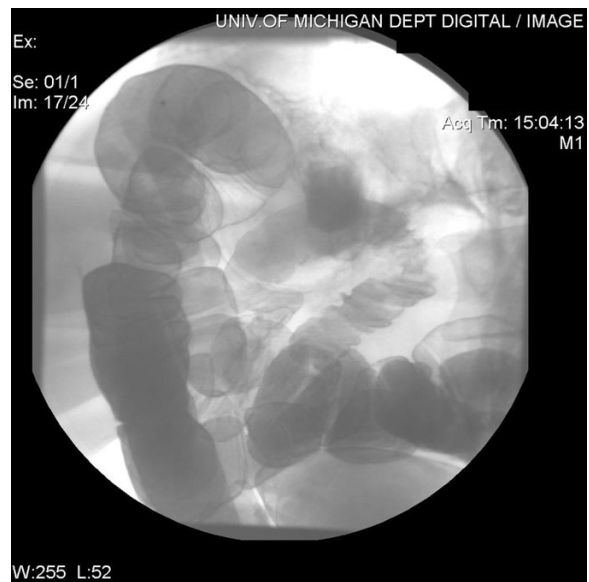
Figure 4 Follow-up barium enema revealing no evidence of distal obstruction and anatomy suitable for segmental intestinal resection of the enterocutaneous fistula. Contrast refluxed from the anus through the previously obstructed area, and out the fistula.