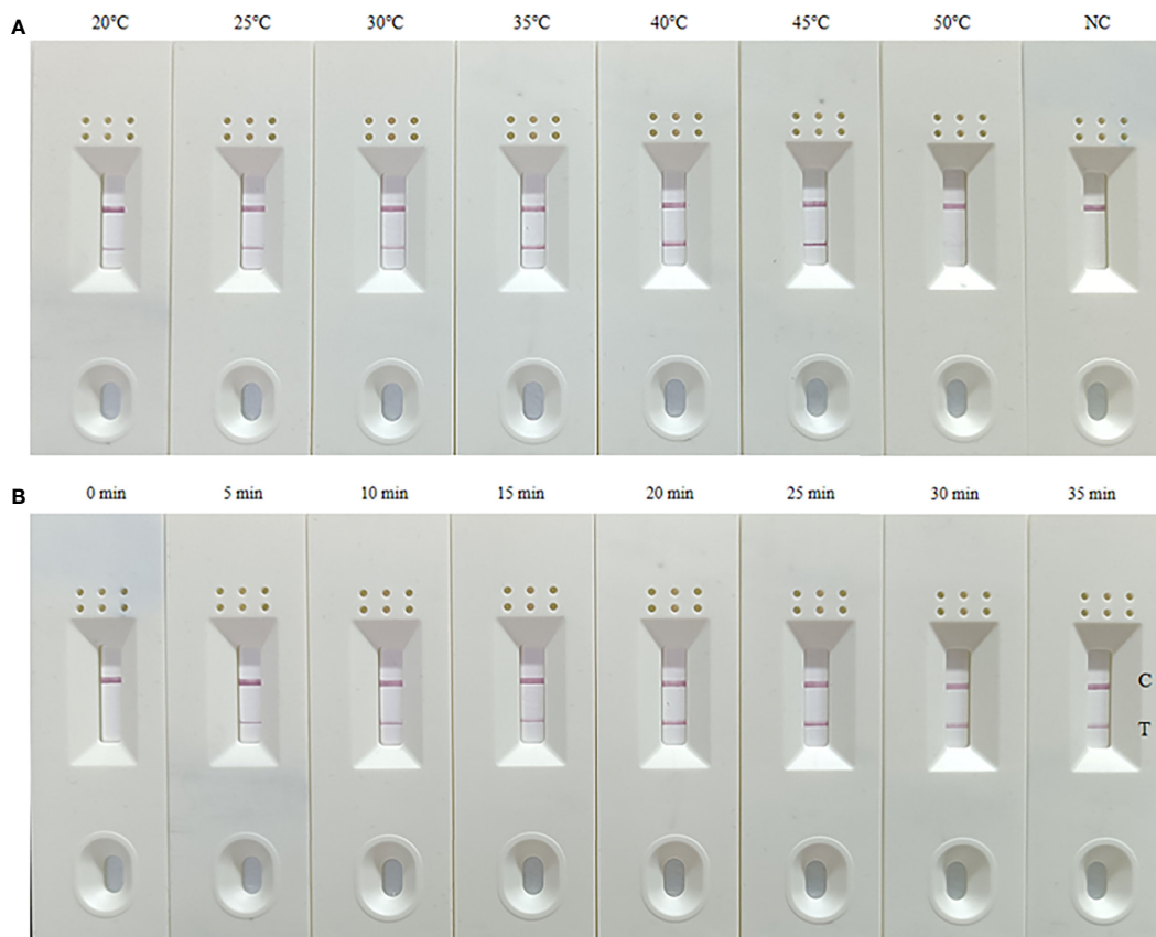
FIGURE 1 Optimization of the temperature (A) and time (B) for the MIRA-LFD assay. (A) The optimal amplification reaction time was determined by examining various temperature settings ranging from 20 to 50°C; (B) The optimal amplification temperature was determined by examining different time (0-35 min). NC, negative control; C, control line; T, test line. These experiments were repeated three times.