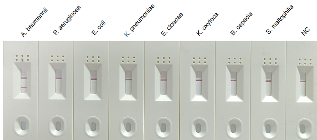
FIGURE 2 Specificity of the MIRA-LFD assay. Results showed that only the positive control sample and A. baumannii isolates produced amplification signals, whereas other non- A. baumannii isolates and negative control produced no amplification signals. NC, negative control; C, control line; T, test line.