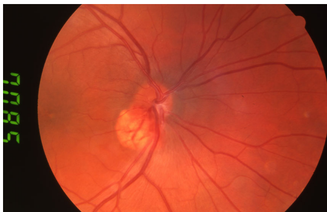
Figure 1 Fundal Photo – Two years after presentation showing an exophytic haemangioblastoma adjacent to the right optic nerve head.