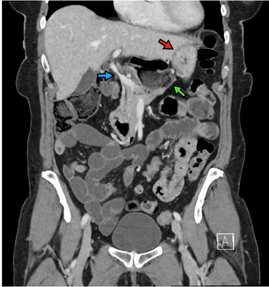
Figure 1: The cecum is absent from the right lower quadrant and is located between the liver and stomach (red arrow) visualized as an air-fluid level (green arrow). Compression of the portal vein by herniated contents is demonstrated (blue arrow).

throughout her epigastrium for approximately 2 hours. The pain was constant and severe, extending across the bilateral upper quadrants. She had experienced pain like this once before within the past year which spontaneously resolved within 4 hours. The patient's last oral intake was an hour before onset of the pain, and she denied any fevers, chills, nausea or vomiting. She was an otherwise healthy woman who took no medications and had no abdominal surgical history. On admission, vital signs were normal, with a heart rate in the 70's. Although initially reported as tender by emergency department staff, after pain medication and intravenous fluids, examination by the surgical team revealed resolution of pain and a soft, non-tender abdomen. Lactic acid on presentation was 5.0 mmol/l, and her white blood cell count was 9600 \mu\text{l}^{-1} , with the remainder of her laboratory values within normal limits. She underwent a computed tomography scan which demonstrated herniation of her cecum through the FoW, causing compression of the inferior vena cava (IVC) and portal vein (Figures 1–3).