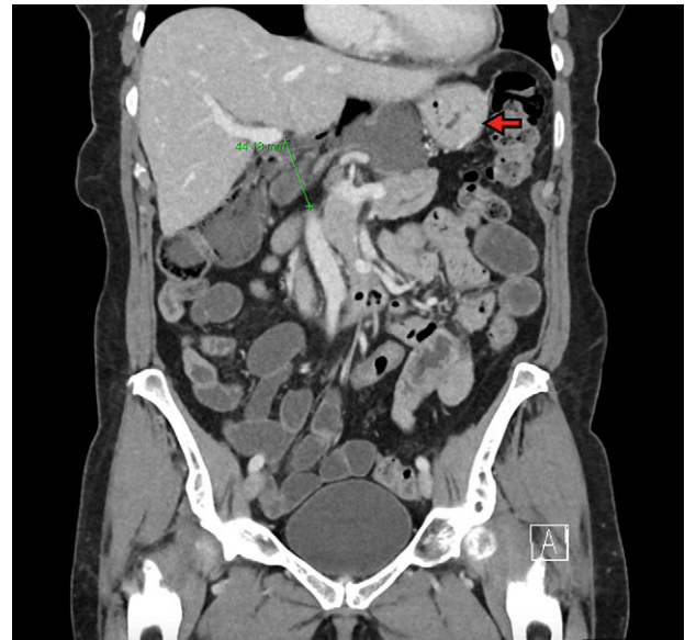
Figure 2: Coronal view demonstrating FoW measurement and herniated contents. The stomach is demonstrated by the red arrow. The FoW is shown to be dilated at 4.4 cm.

Post-operatively, the patient's presenting pain had resolved, she tolerated rapid advancement of diet, and was discharged once bowel function was regained. She was seen in the