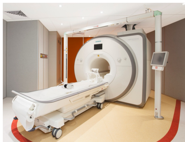
Figure 1. 3T Siemens Skyra with external laser positioning laser bridge and marked 30 gauss line (in red) on the floor.

Standard MR imaging is not ideal for RTP due to geometric inaccuracies, different patient positioning and magnetic field distortions inherently present in MR images. If these distortions are not corrected and minimised, they have the potential to significantly affect treatment doses to the patient as a result of inaccurate volume delineation. 12 This presents a challenge in terms of parameter selection when establishing MRI protocols for RTP purposes.