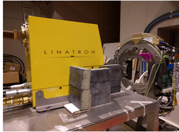
Figure 4. Fixed gantry linatron with multileaf collimators (MLCs) (white arrow) outside the magnetic resonance imaging faraday cage. The bore is positioned that the main magnetic field is aligned parallel with linatron beam.

The development of a linear accelerator with an integrated MRI provides the potential for advanced image guidance techniques. Collaboration and cross-training between RT and medical imaging is thus vital. This will allow optimal utilisation of any MRI-D system in terms of making appropriate imaging decisions and troubleshooting in a timely fashion for adaptive treatments. The Ingham Institute for Applied Medical Research along with other research groups is in the process of developing a 1 Tesla MRI-guided linear accelerator (Appendix 1). Liverpool Cancer Therapy Centre currently houses Australia's first prototype MRI-Linac driven by the Ingham Institute. The system is in its second phase of testing with recent installation of a unique split-bore magnet and Linatron (Fig. 4). Although the Australian system is still in the testing phase, ViewRay have an MRI-guided cobalt system available for patient treatments 18 and it is expected that the first patient treatments with an Elekta MRI-Linac system will occur in the near future. 19 The radiographers and radiation therapists at Liverpool Cancer Therapy Centre have been involved in the MRI-Linac project including the initial design phases of the patient rotation device 20 and imaging on the first prototype design. 21 The role of radiation therapists and radiographers in this technology