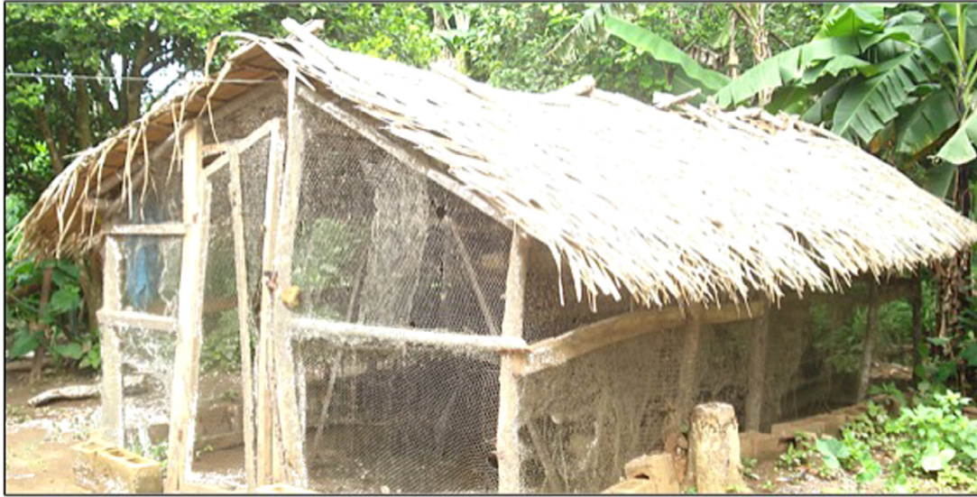
Fig. 3. Backyard poultry house in Imota farm settlement, Ikorodu, Lagos State Nigeria. Source: Nusirat Elelu, 2009.