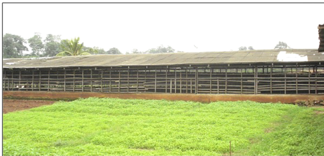
Fig. 2. Large-scale poultry farm in Ikorodu North Farm Settlement (Odogunyan), Ikorodu, Lagos state Nigeria.