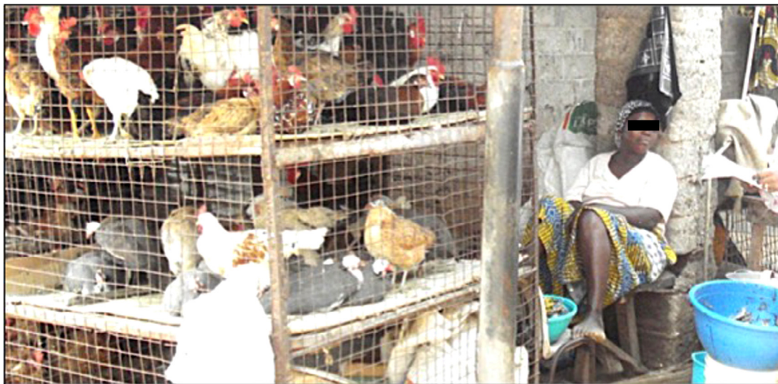
Fig. 4. Ejina Live bird market in Ikorodu Central, Lagos State Nigeria.

Hence public health campaign strategies should involve education on transmission related risk to population involved in poultry business. This could encourage uptakes of adequate protective measures in the course of poultry handling thereby improving public health campaign. For example, a KAP study carried out in Vietnam showed that knowledge of risk of eating sick/dead birds and perception of the threat of avian influenza H5N1 was a factor that motivated respondents to seek healthcare [18]. In addition, a past study suggested that conventional education and behavioural change messages for prevention have limited effect on population at high risk of AI [19]. There is therefore need to explore other approaches such as the active involvement of high risk groups in formulating control strategies. The FAO had previously suggested involving poultry sector stakeholders in a participatory process to ensure those who will implement preventive measures understand the benefits of doing so [20]. Also this study shows that older respondents and those spent longer time in the profession have significantly higher preventive practice scores and are more likely to adopt preventive measures. Hence, older poultry workers could