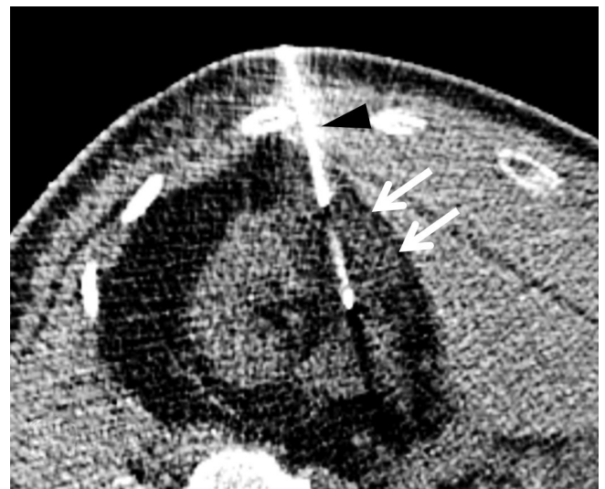
Fig. 2. Percutaneous cryoablation in a 63-year-old male. Non-contrast axial CT image showing one (arrowhead) of two cryo-applicators placed in the right renal cell carcinoma. An ice ball (arrows) was created to ablate the tumor.

procedures (Figs. 1, 2) [15,16]. Furthermore, this imaging modality clearly shows the ablation margin during cryoablation procedures. In contrast, the ablation margins during RFA or MWA are relatively unclear. A high radiation dose is a challenge when CT is used for guidance [19]. The low-dose CT protocol is useful for Asian patients with relatively lower body mass indices [18]. US is a useful