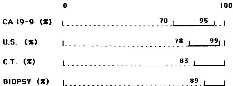
Figure 1 95% confidence limits for serum CA 19-9 assessment (CA 19-9), abdominal ultrasound (U.S.), abdominal C.T. scan (C.T.) and pancreatic percutaneous fine-needle biopsy (biopsy), calculated for sensitivity, specificity and predictive value.

cytological diagnosis. On the other hand, the finding of numerous inadequate specimens in different fine-needle biopsies is in our experience suggestive of chronic pancreatitis.