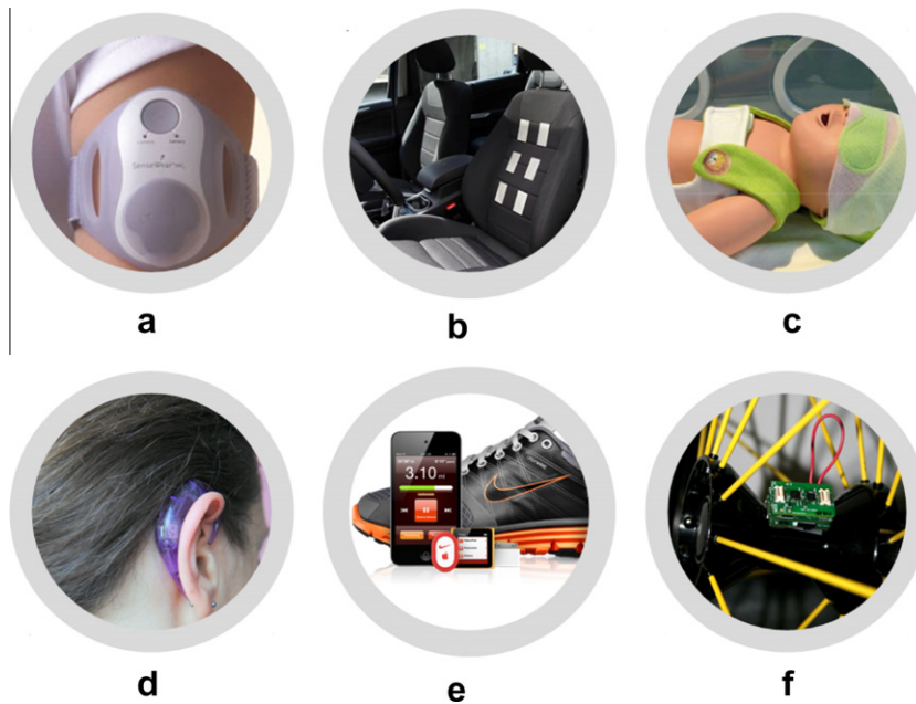
Fig. 2 Sensors that can be embedded in everyday surroundings: (a) the Sensewear armband; (b) ECG monitoring on a car seat; (c) a sensor-jacket for neonatal monitoring; (d) an ear worn activity recognition sensor; (e) the Nike+ipod shoe-based sensor for monitoring running; and (f) a sensor to observe wheelchair motion and paralympic athlete performance.

simple mobile phone programs, such as the iStethoscope, 9 can potentially help with tracking the trend of chronic heart disease in the world population.