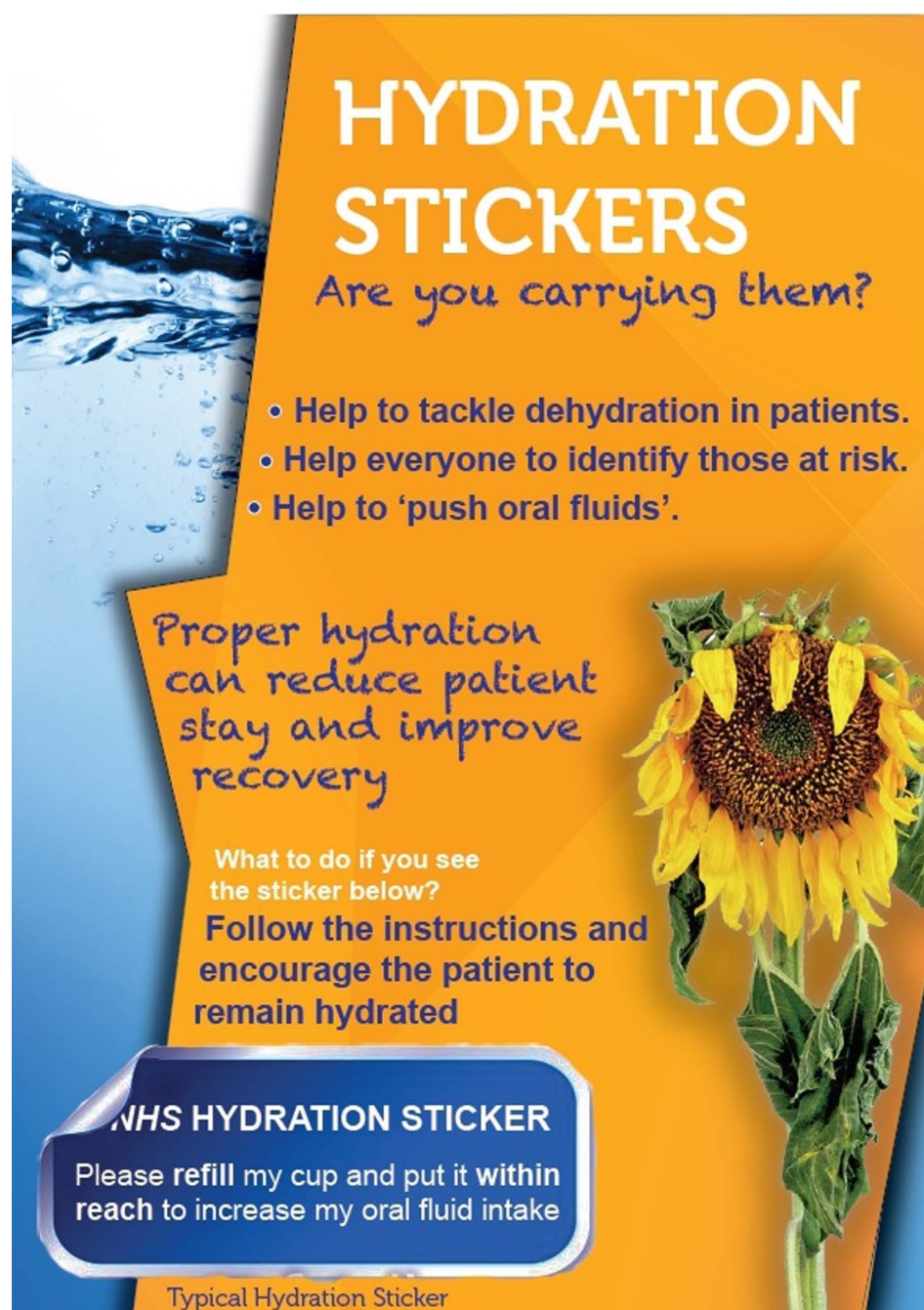
Figure 2 Hydration Stickers Poster

Lack of awareness of the stickers was predicted to be a potential barrier to the successful implementation of the scheme. Therefore, the Quality Improvement team developed posters highlighting the Hydration Stickers scheme that would be placed in key locations on the AAU and Stroke ward. Hydration Stickers were promoted to staff via the poster campaign, during MDT meetings, as well as through verbal encouragement on the AAU and Stroke Ward. Success of the intervention was measured over 3 weeks.