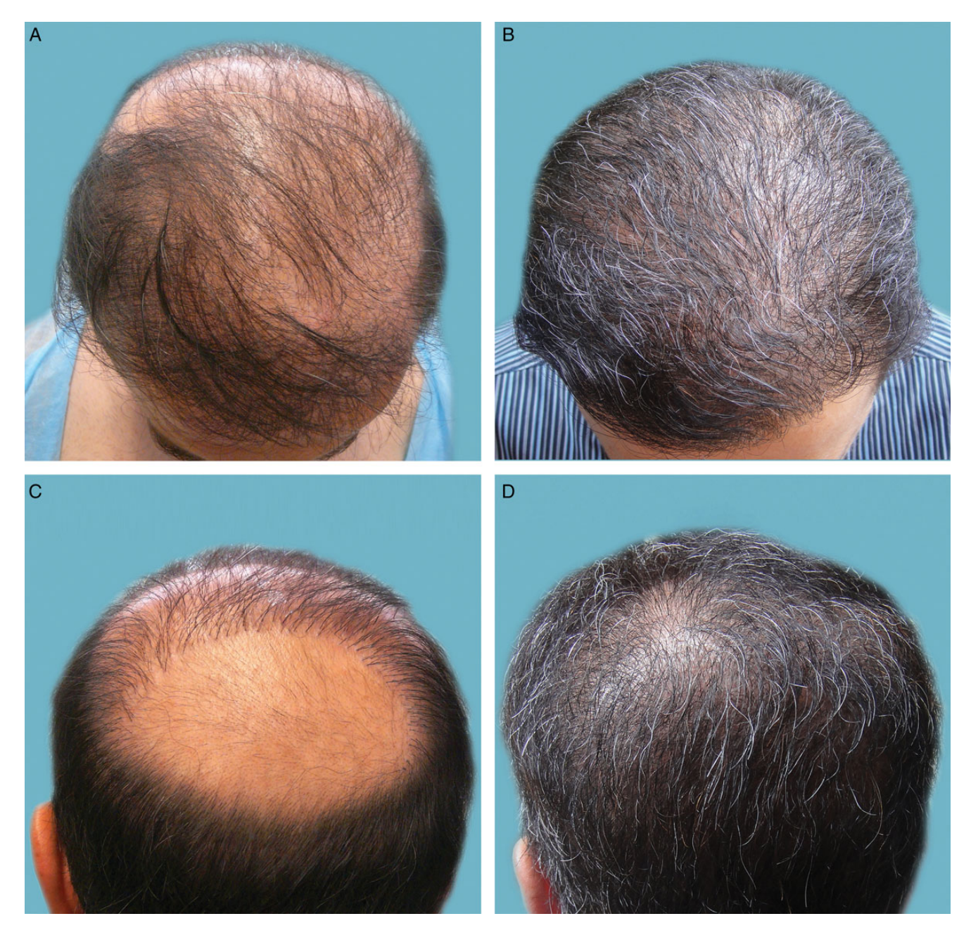
Figure 6. (A, C) Preoperative and (B, D) 12-month postoperative photographs of a 46-year-old man. The preoperative bird's eye view (A) shows multiple failed attempts at hair restoration with head donor surgeries and the preoperative crown view (C) shows a mostly bald area with surrounding pluggy, misplaced rows of hair. The postoperative photographs demonstrate a hairline (B) repaired with mainly chest hair to fullness and a softer look and a completely restored crown view (D) after transfer of 14,000 grafts from head and beard.

and overall satisfaction with the results. For healing status, the mean score was nearly as high for beard-involved donor BHT patients (8.7) as head and NPA-involved donor BHT patients (8.9). Incidentally, the overall satisfaction score with BHT in this study regardless of donor source (8.3) was the same as the overall satisfaction score achieved when only finer head hairs from the NPA areas were used to create softer hairlines and temples (8.3).<sup>18</sup>