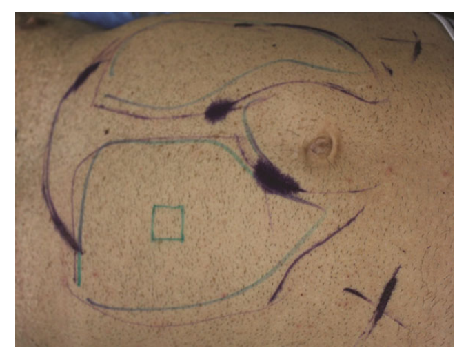
Figure 2. Viable and nonviable areas of donor hair extraction in the abdominal area demonstrated on this 40-year-old man. The uniformity and density of hair within the encircled area is satisfactory, but the lower abdominal areas indicated by the X are not.

(BHR) describes use of head or body hair in areas of loss in nonscalp areas (such as pubic or eyebrow hair restoration or eyelashes).<sup>8-14</sup> Body hair from the beard, trunk, and the extremities can be transplanted by follicular unit extraction (FUE) methods and combined with head hair, if available, to cover both scalp and nonscalp areas to improve severe baldness,<sup>1</sup> create more natural and softer hairlines,<sup>5</sup> repair donor strip scars from previous hair restoration surgeries,<sup>6</sup> and restore facial and body hair.<sup>8-13</sup>