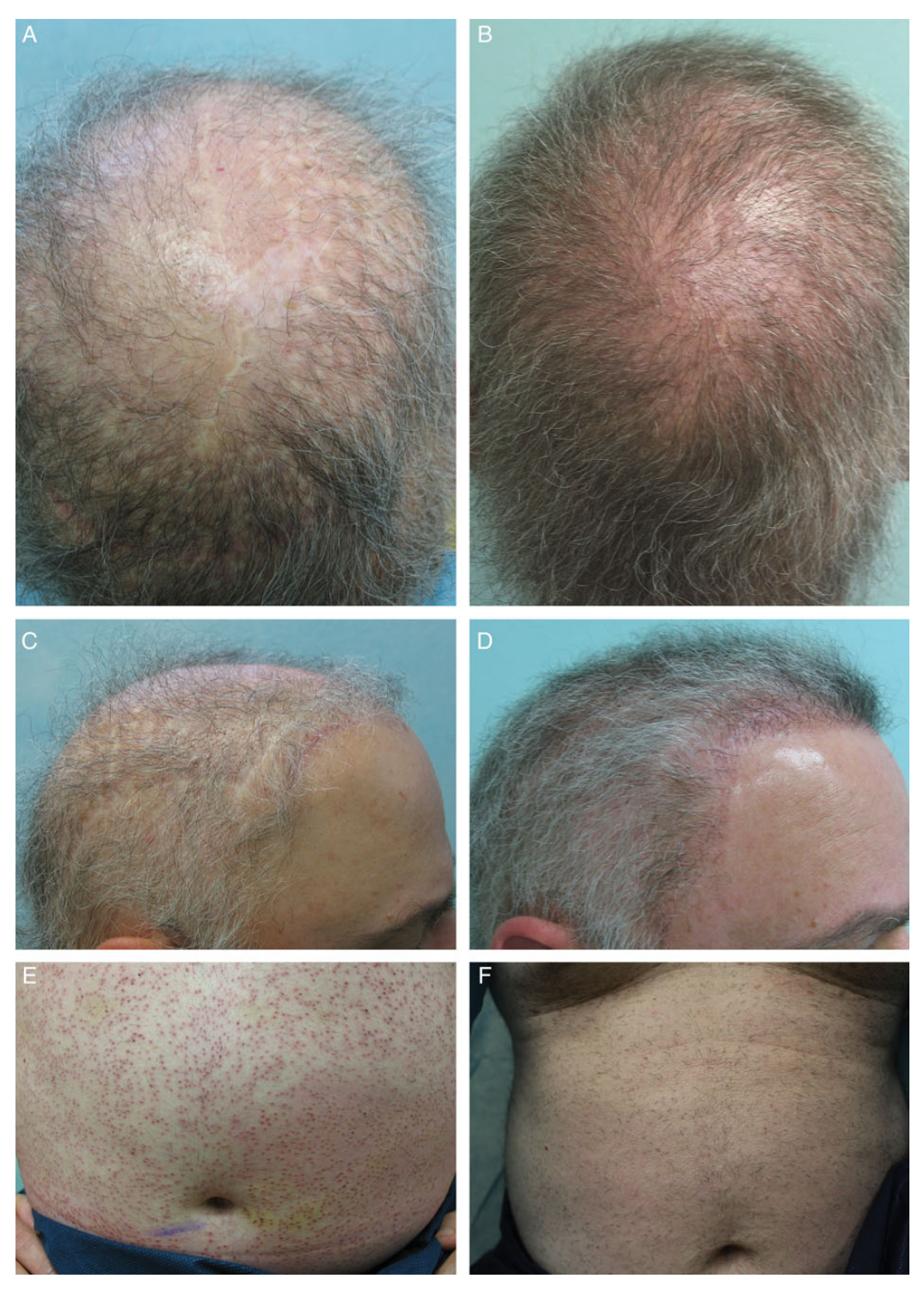
Figure 7. (A, C) Preoperative and (B, D) 6-month postoperative photographs of this 58-year-old man. This patient is an example of severe baldness compounded by exhaustion of head hair donor sites due to previous hair transplantation surgeries. Linear scars of scalp reduction (in crown) and 4 mm punch scars are visible in the occipital and parietal regions (A). In addition to severe thinning, there are linear scars from past temporoparieto-occipital flap surgery in the hairline and temples as well as 4 mm punch excision scars in the parietal regions (C). The postoperative photographs show much improved coverage for the crown of the head and camouflaging of prior surgical scars and aesthetically pleasing hairline and temple coverage (B), as well as the obfuscation of the linear scars in the hairline and temples (D). The patient's abdominal area a few days after body hair extractions (E) and the abdominal region showing healed BHT extraction area about 3 months postoperatively (F). On very close examination, insignificant white dots are visible.