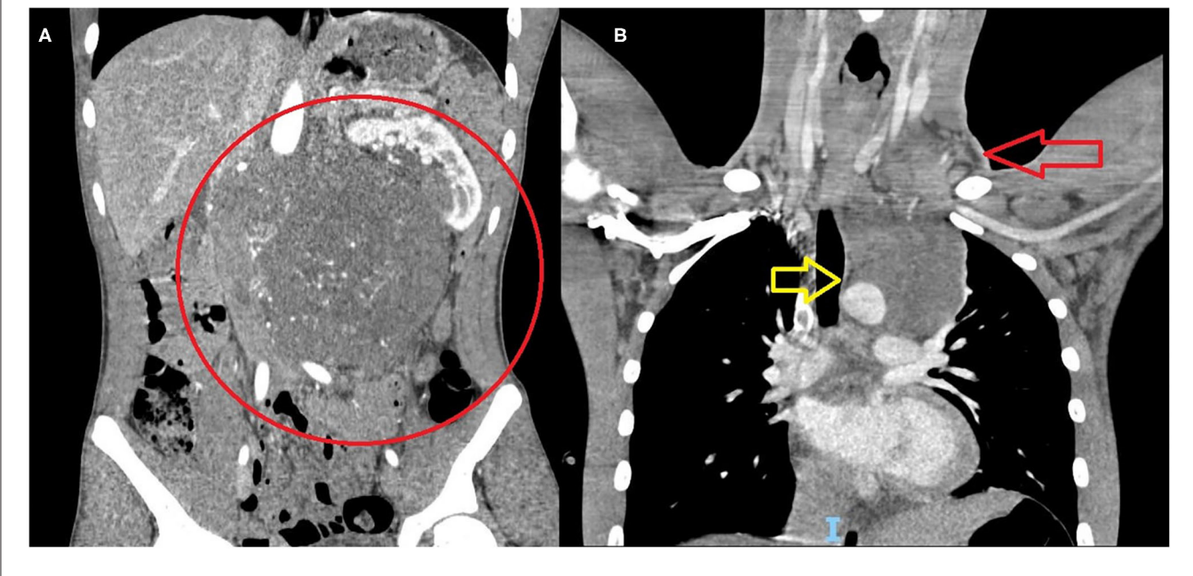
FIGURE 2 | Massive metastatic involvement of retroperitoneal (A) and mediastinal (B) lymph-nodes.