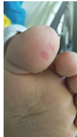
FIGURE 1: Janeway lesion on patient's left toe.

2.3. Therapeutic Intervention. Antibiotic therapy with vancomycin for infectious endocarditis was initiated due to the