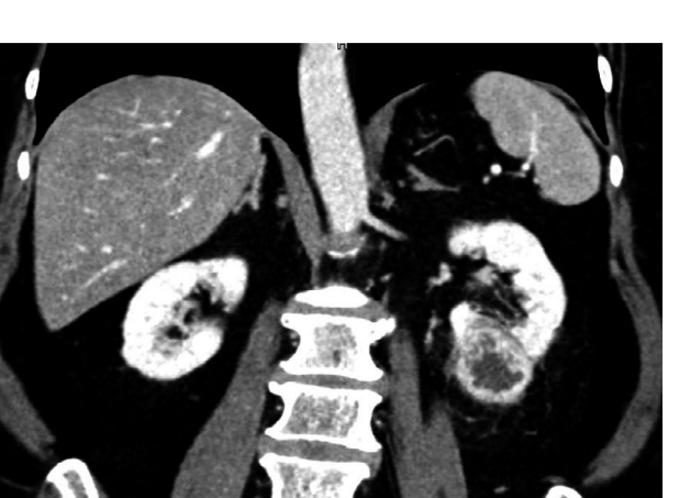
FIGURE 1 CT scan, preoperative. A 4.2 \times 3.6 \times 4.3 cm large mass in the lower pole of the left kidney

In addition, a genetic examination for VHL disease was performed. It revealed normal findings for the DNA sequencing of the VHL-coding exons and normal findings on the multiplex ligation-dependent probe amplification analysis