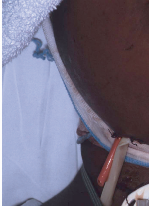
FIGURE 3: Patient postintervention. Note large number of drains.